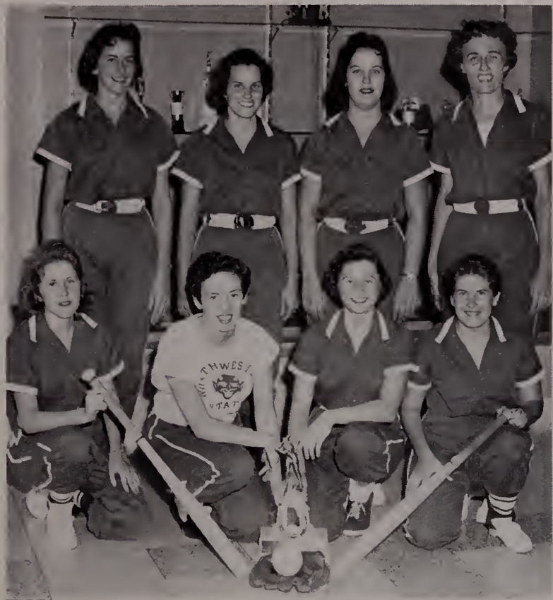
The N. S. C. School of Nursing, Shreveport Division, won the State Softball Championship this year. This is the second such championship won by this division, the previous one in 1955.

The Nursing School, Shreveport Division, are perennial champions in women's sports, having won city championship softball in 1954, 1955, and 1958; City basketball championship in 1955, and 1956; and Tri-State basketball championship in 1956.